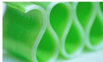
Ribbon candy with lots of S shaped turning and a dressage test serpentine.