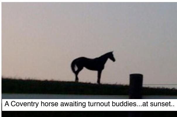
A Coventry horse awaiting turnout buddies...at sunset..