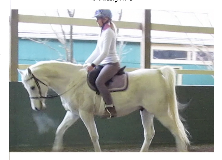
Horse & rider learned how to stretch for the contact by learning how to chew the reins out of the hands at a whoa. Rider above is applying these skills at the walk - flex and stretch