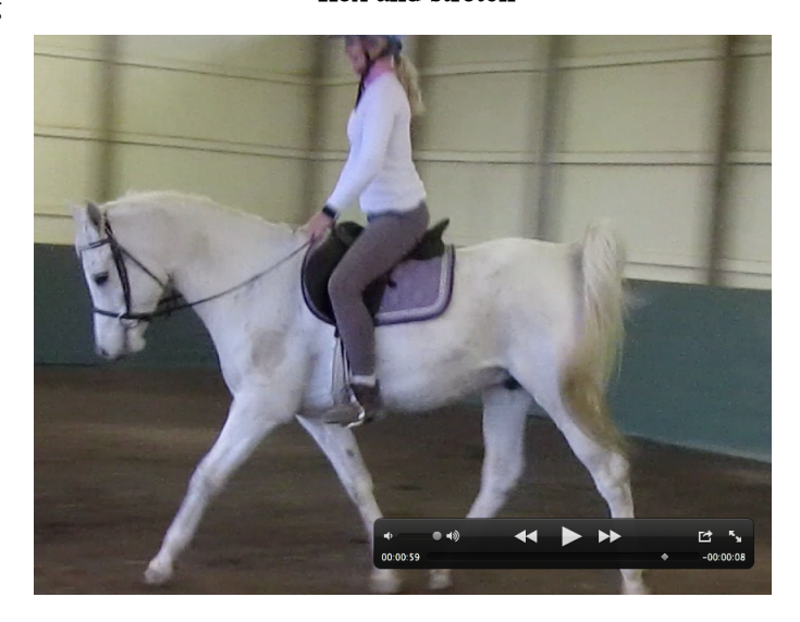
The horse above is soft at the poll or has abstrossen, we learned a new word! A little slack in the rein, however, in next photo the horse is taking up the contact but,... there is always a but and a butt!