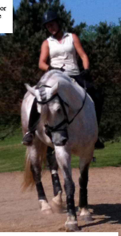
Horse is bending left & rider has support of outside rein resulting in shoulder being up & not "popped."