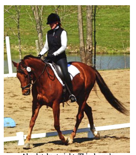
Absolutely straight. This horse's shoulders are in alignment with the haunches. When the horse is straight it tracks evenly with both hind legs.

stretch," meaning on all sides of their body with the rider always being able to control the shoulders with the outside rein.