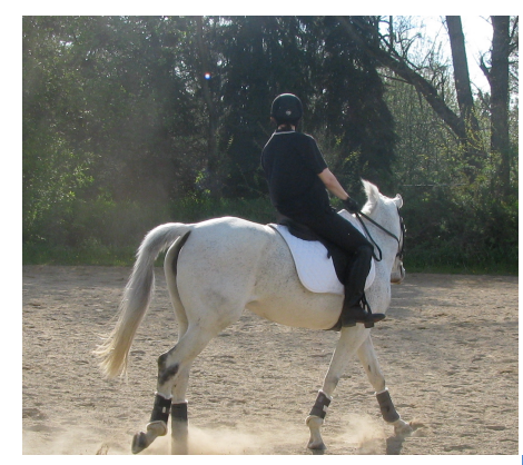
This horse's outside shoulder is popped or bulging. Rider has no support with the outside rein...

The reason we talk about the shoulders is to get the horse straight and, as a result, balanced. But why do we care if the horse is straight or balanced? We want our horses straight and balanced so they will work evenly on both sides of their bodies. Why do we want our horses to work evenly on both sides of its body, to impress a judge for dressage shows or to develop our horse as an athlete? The answer is both. Dressage tests simply evaluate how well you are training your horse. Each movement is performed in both directions tracking right and left so the judge can score how well you train your horse in each direction.